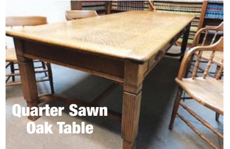
Quarter Sawn Oak Table